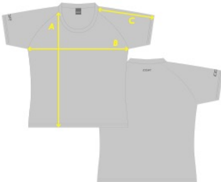
SIZE IN CM