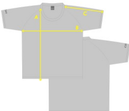
SIZE IN CM